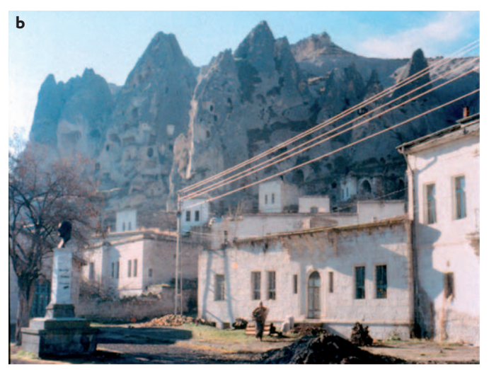
of Karain is shown, where the houses are built with carved blocks of stone quarried from the erionite-containing rock from the nearby mountain and river.